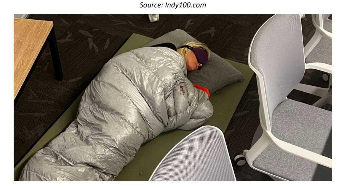
Exhibit 6. An Image of Elon Musk Sleeping in the Office

When beds showed up in the workplace with no announcement, employees believed they were beds for workers to stay in the office overnight. To them, it was another sign of disrespect—there were no conversations (Anguiano 2022). The company acquired "modest bedrooms featuring unmade mattresses, with four to eight beds per floor. The changes appeared to be part of Musk's plan for "hardcore Twitter" in which he'd demanded workers dedicate "long hours at high intensity" after he fired nearly half the company's workforce (Anguiano 2022).